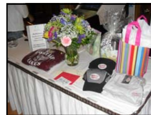
Door prizes donated by our great Chamber members!