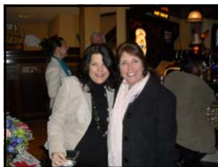
Chamber members enjoying the atmosphere & networking