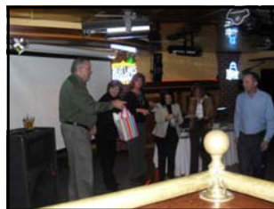
Passing out the door prizes at the Business After Hours